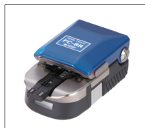
Handy cleaver FC-8R series