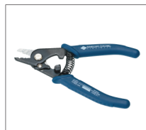
Jacket remover JR-M03