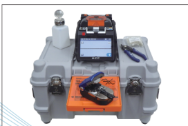
Carrying case with worktable CC-72