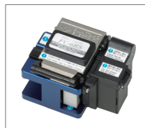
Table-top cleaver FC-6 / FC-6R series